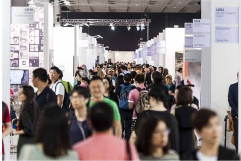
Art Basel in Hong Kong 2014.

We talked to a few top dealers participating this year at Art Basel in Hong Kong to see what they were bringing and why.