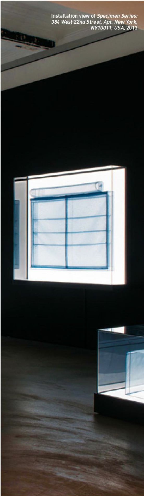
Installation view of Specimen Series : 384 West 22nd Street, Apt. New York, NY10011, USA, 2013