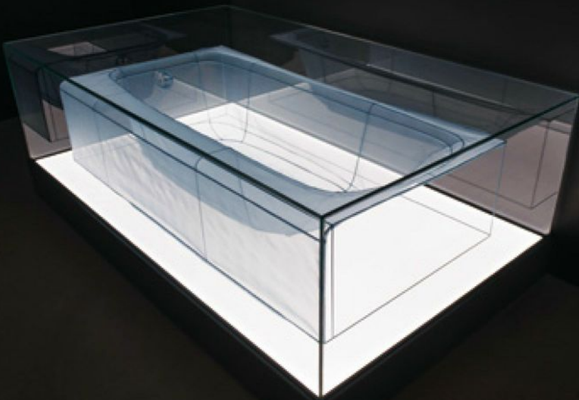
Medicine Cabinet, 2013