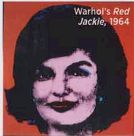
Warhol's Red Jackie , 1964