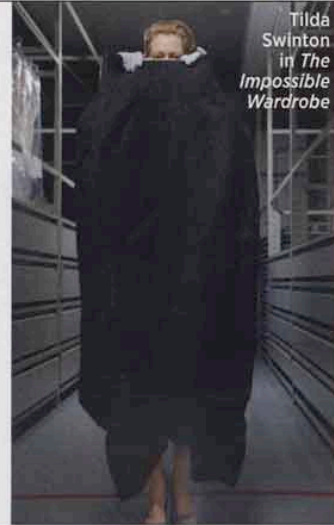
Tilda Swinton in The Impossible Wardrobe