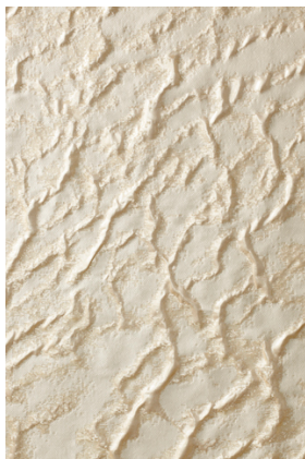
K. HOSOO “Wave 2” 2014 65% Silk, 35% Paper