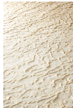
L. HOSOO “Wave 2” 2014 65% Silk, 35% Paper