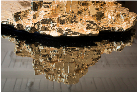
G. Teresita Fernández “Rorschach” 2014 Detail fused nylon, gold chroming 6.5x61.857x25.65 inches