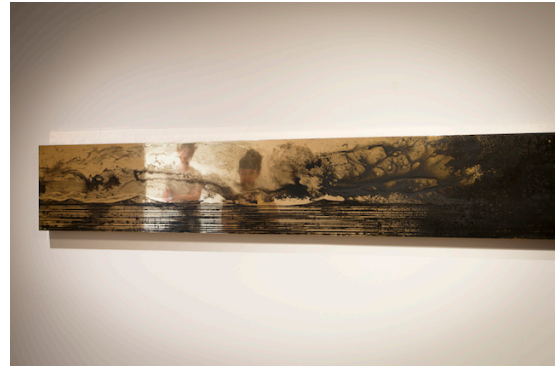
H. Teresita Fernández “Golden (Scroll 1)” 2014 gold chroming and india ink on wood panel 1 x 9 ft