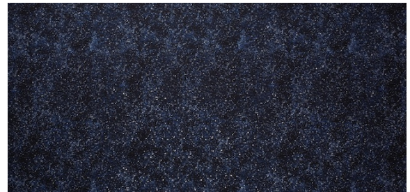
J. HOSOO “Starry Indigo” 2014 85% Silk, 10% Paper, 5% Polyester