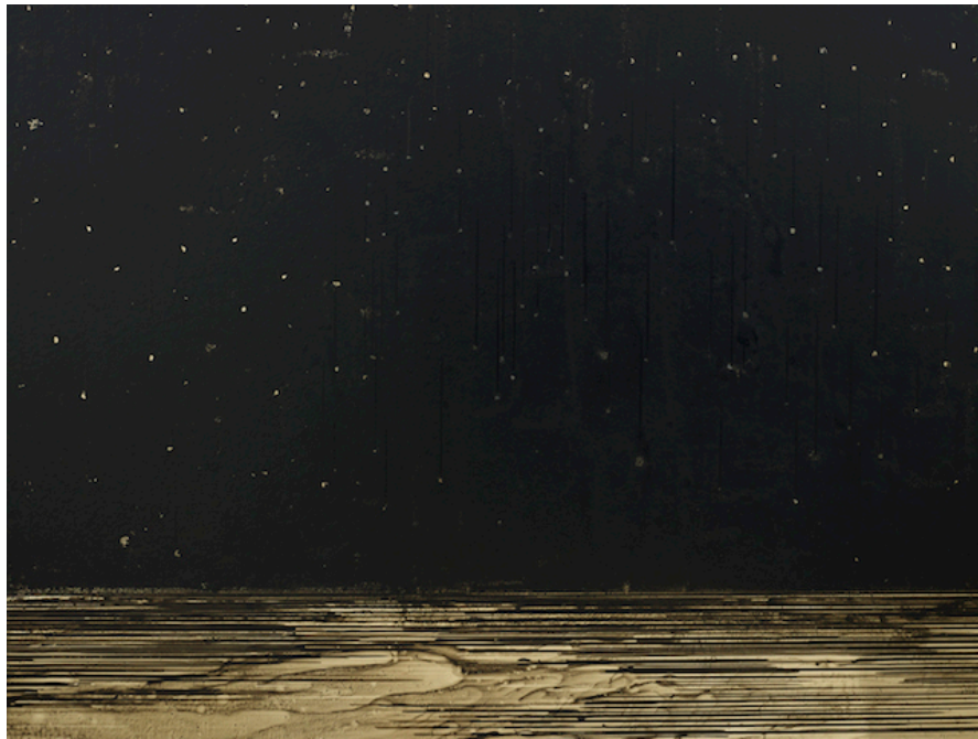
Teresita Fernández “Golden (Onyx Sky)”

Thursday, October 2, 2014 – Friday, January 16, 2015