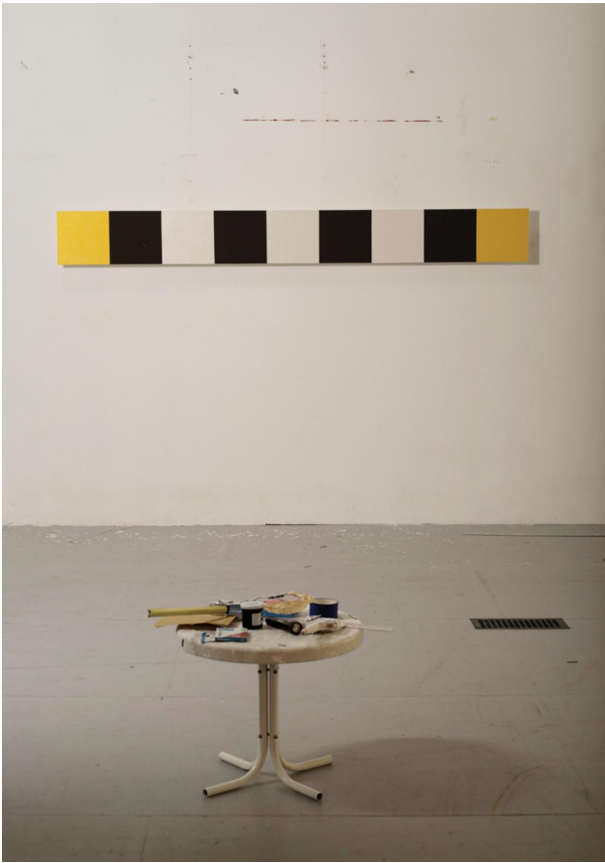
TOOLS OF THE TRADE Corse's painting Untitled (Yellow, Black, White, Beveled), 2010. PHOTO: MARY CORSE, UNTITLED (YELLOW, BLACK, WHITE, BEVELED), 2010, GLASS MICROSPHERES IN ACRYLIC ON CANVAS, 12 X 108 INCHES

Flavin, Donald Judd, Walter De Maria and Louise Bourgeois, among other greats, while Lisson will present eight new pieces. The Whitney survey, which opens on June 8, will consist of more than two dozen works from the past 54 years. The luminous abstract canvases that will be seen there—each packs a maximal wallop with minimal means—will be a discovery for many visitors.