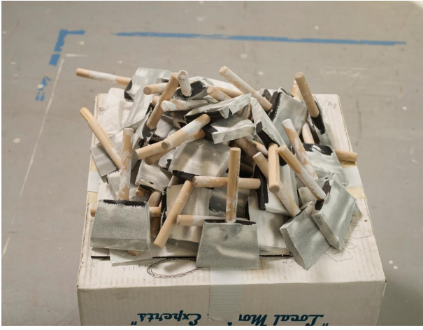
A heap of used foam paintbrushes.