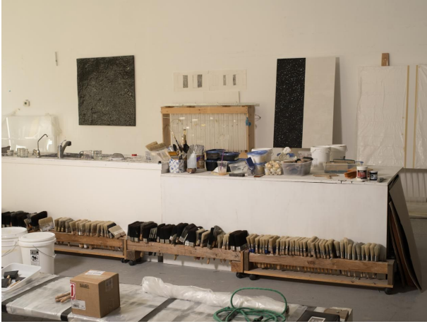
A scene from Corse's studio. From left, “Black Earth,” fired earth clay, 48 x 48 inches, circa 1975 and works in progress.

As the works at the Whitney demonstrate, Corse has been on a remarkably consistent artistic trajectory for decades. “Capturing light has been her quest,” notes Conaty. The earliest painting in the show, 1964’s Untitled (Octagonal Blue) , is one of the rare instances of color; many of the other pieces are predominantly white. “Different colors make for different internal journeys,” says Corse. “They create emotions and feelings.” But the clue is in the materials: The metal flakes embedded in the acrylic blue paint show her trying to render light. That quest continued with her fluorescent light boxes, like Untitled (White Light Series) from 1966.