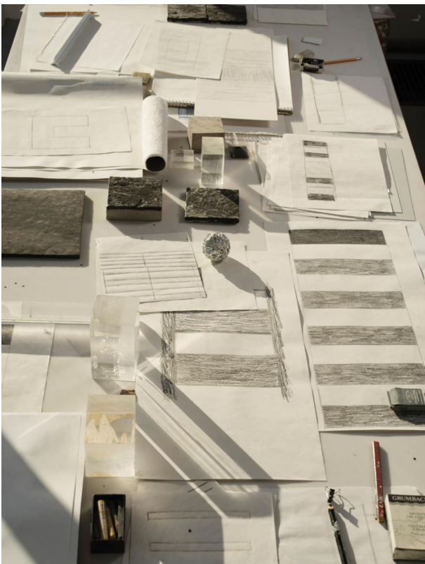
Sketches of works in progress and general ephemera.