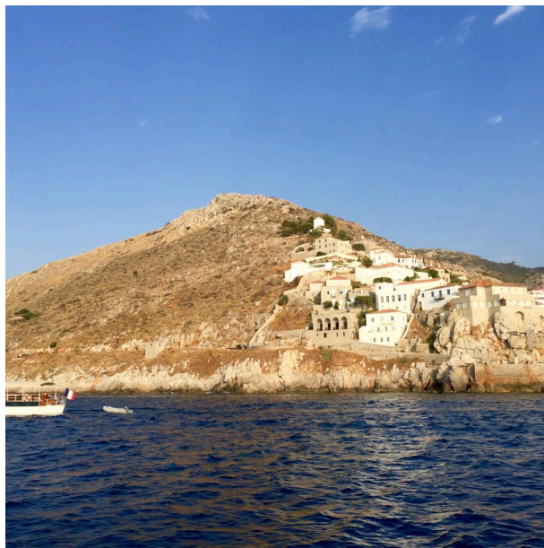
The Island of Hydra.

Edinburgh Art Festival runs from July 28-August 28 2016