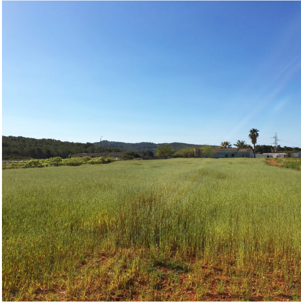
The site of the new sculpture park

7. Outdoor Sculpture Project by Parra & Romero ( http://www.parra-romero.com ) Ibiza has gone a long way to shaking off its “clubbing hotspot” label, and is becoming a different kind of destination. ( https://news.artnet.com/market/jenny-holzer-art-ibiza-524099 ).