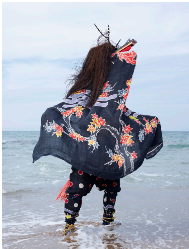
Ogi Mejishi, Sadogashima Niigata prefecture.