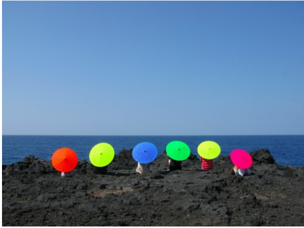
Peter Saville performance in Stromboli, 2013.