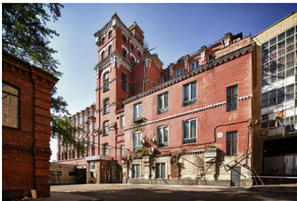
Trehgornaya Manufactory, building #5.

Volcano Extravaganza in Stromboli runs from July 15-21