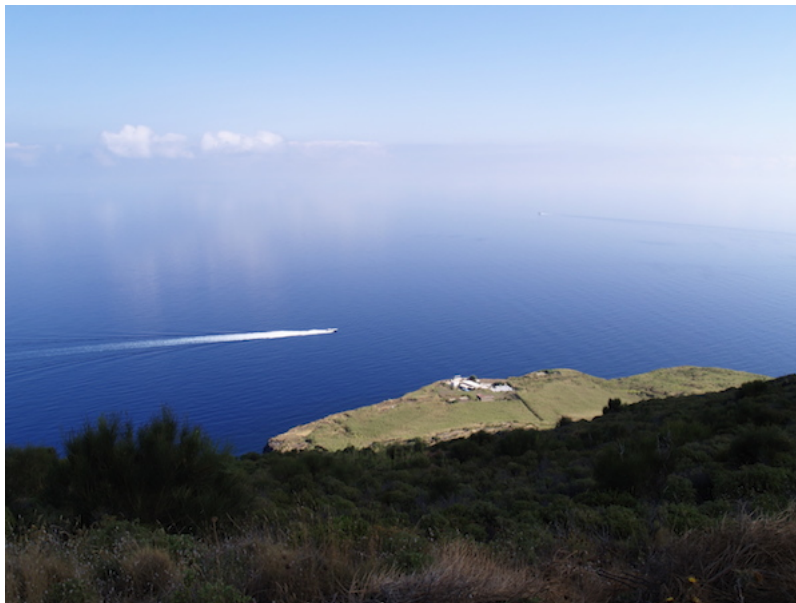
Stromboli.