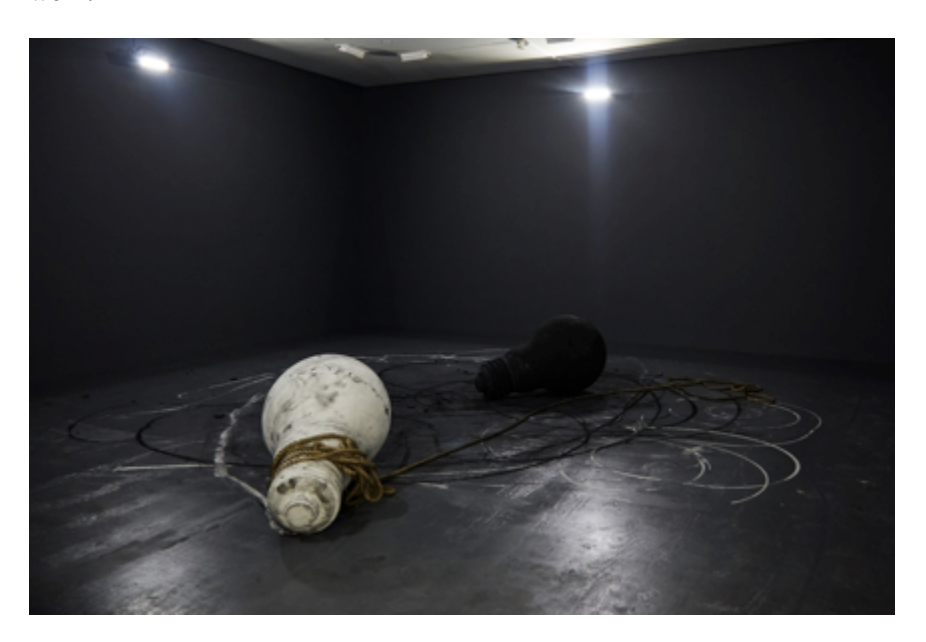
"We take the notion of light for granted, so I wanted to play with that with this piece."

"This show is tied to this very strong notion of drawing, embracing the materials of chalk and charcoal to embody memory and artistry. Chalk and charcoal bring together the notions of black and white for me. The show tries to capture not only the performative impulses but also creative impulses in my work."