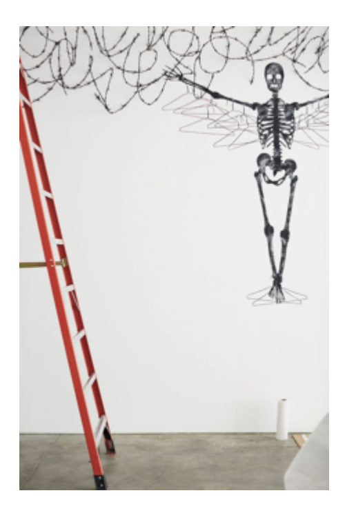
"The hangers embody a sense of religious iconography. The barbed wire evokes mark making. It's a way of seeing the urban situation."