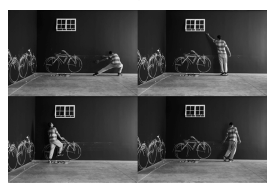
"When I was in high school, we used to steal chalk from the classroom and then take one of the young boys into the toilets, draw a bike on a wall with the chalk, and force the kid to interact with the drawing, by 'riding' it."