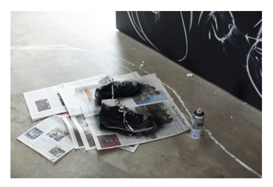
"In school, we didn't have art education or any facilities, and chalk was the cheapest mode of expression. We channeled our creativity onto the concrete walls."