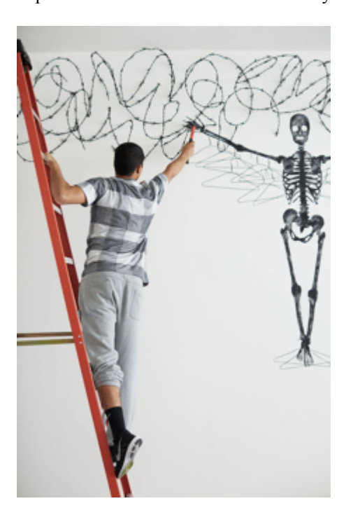
"In the 1950s, Duchamp created a piece where he installed multiple hangers from the ceiling that resembled a flock of birds. This man has hangers attached to his skeletal structure so that he becomes a bird."