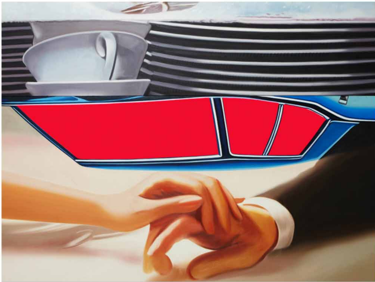
Acquavella has long been the exclusive gallery of American painter James Rosenquist, whose The Facet, 1978, is on offer at the fair.