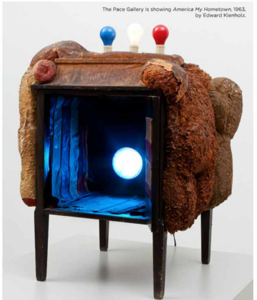
The Pace Gallery is showing America My Hometown , 1963, by Edward Kienholz.