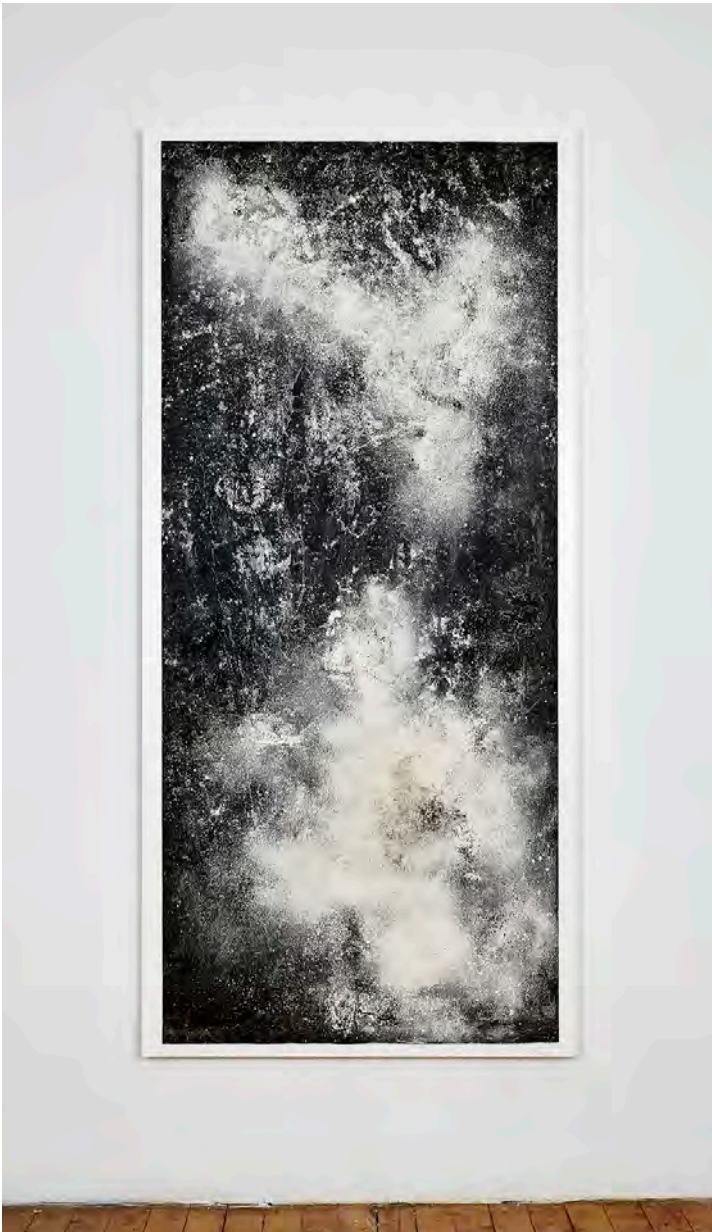
JEFFREY MERIS I, Used To Be XIII , 2021 plaster particles on roofing paper, double sided adhesive tape 81 x 42 x 3 inches 205.7 x 106.7 x 7.6 cm LM33998