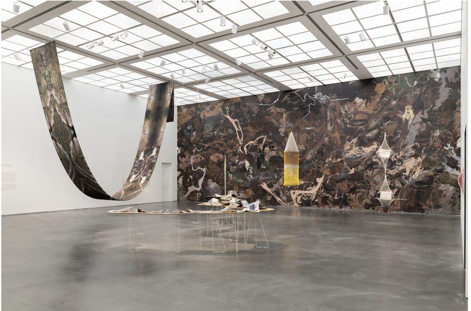
CAROLINA CAYCEDO Yuma, or the Land of Friends II , 2020 printed vinyl wallpaper 196.06 x 324.02 inches 498 x 823 cm Edition of 2 with 1 AP (exhibition copy) LM33994