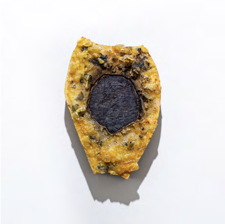
FRANCHESKA ALCÁNTARA Tiger Jaw III, 2022 Hispano cuaba soap, acrylic and resin on wood 12 x 9.5 x 3 inches 30.5 x 24.1 x 7.6 cm LM33798