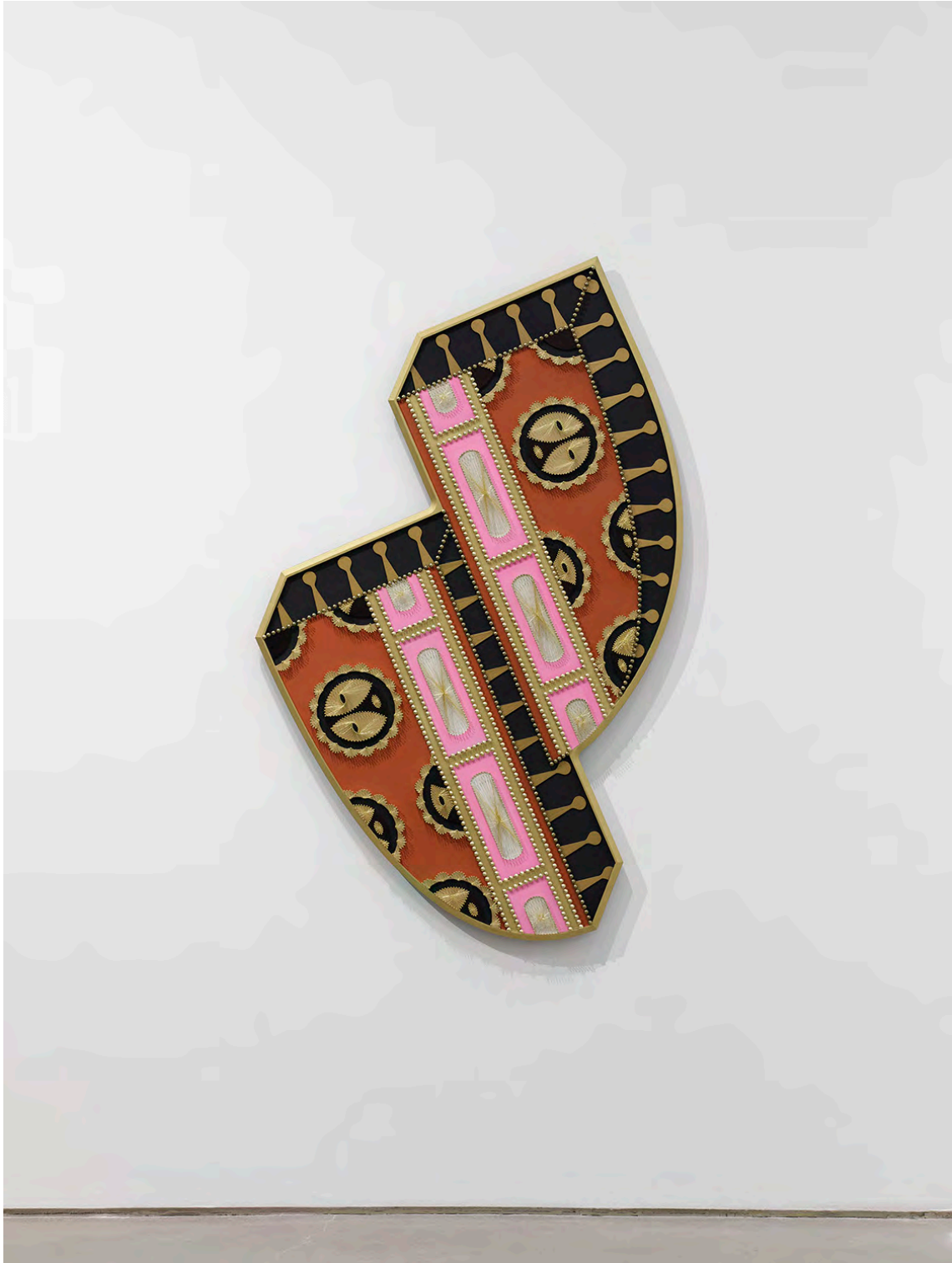
GLENDALYS MEDINA The Sun (El Sol) , 2020 paint, ink, oil pastel, thread and nails on wood 42 x 56 inches 106.7 x 142.2 cm LM33786