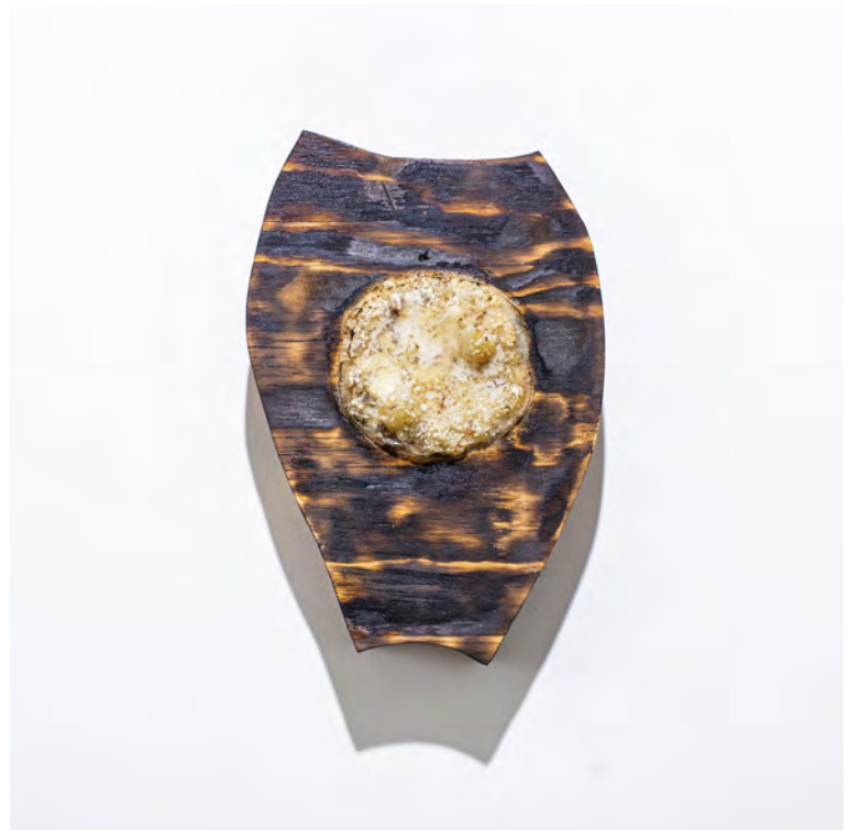
FRANCHESKA ALCÁNTARA Tiger Jaw IV, 2022 Hispano cuaba soap, acrylic and resin on wood 12 x 9.5 x 3 inches 30.5 x 24.1 x 7.6 cm LM33799